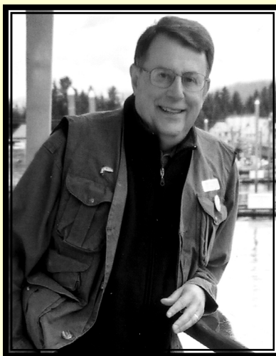
Watch for fly fishing lessons. Information available soon!